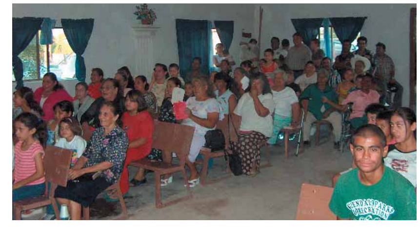
We ministered in two places each night. Sometimes in churches (as shown here) and sometimes evangelism on the street of a little town without a church. The bus was a useful tool to carry "the feet of those who bring good news." It was a blessing to be a part of this ministry!